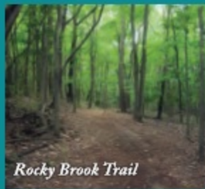
Rocky Brook Trail