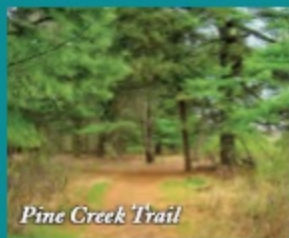
Pine Creek Trail

Use these small lots to access the lake for fishing and boating.